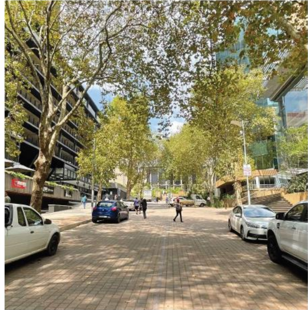
Strip lights along eastern block between Biccarrd str. and Joburg Theatre