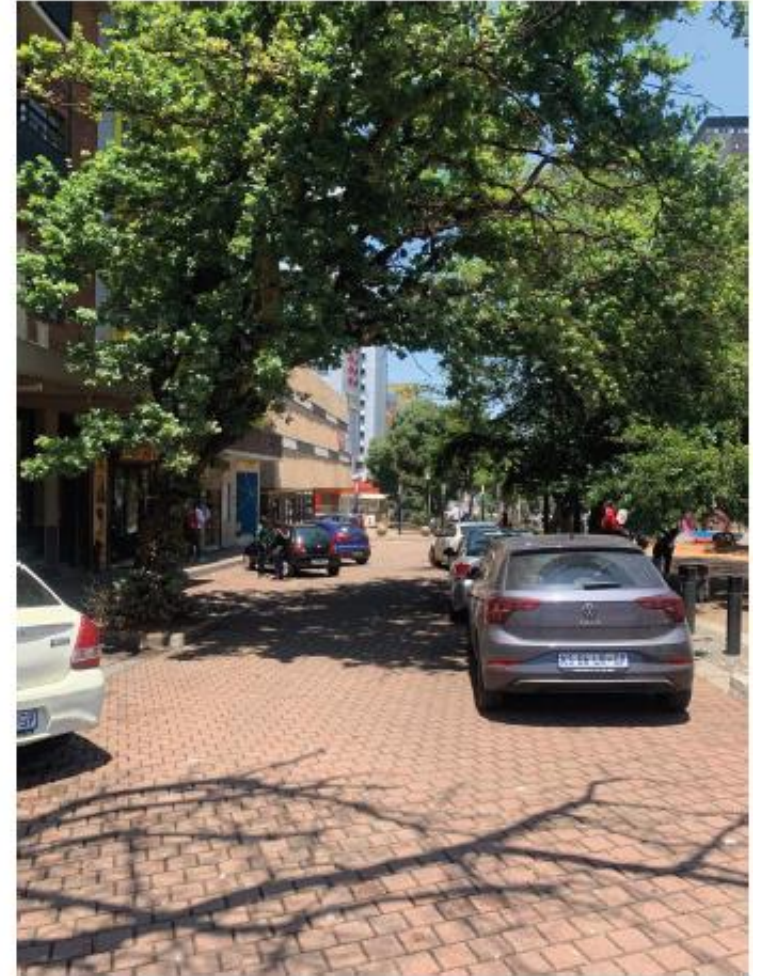
Existing Eland square - existing mature trees do not deem the need for additional shading structures