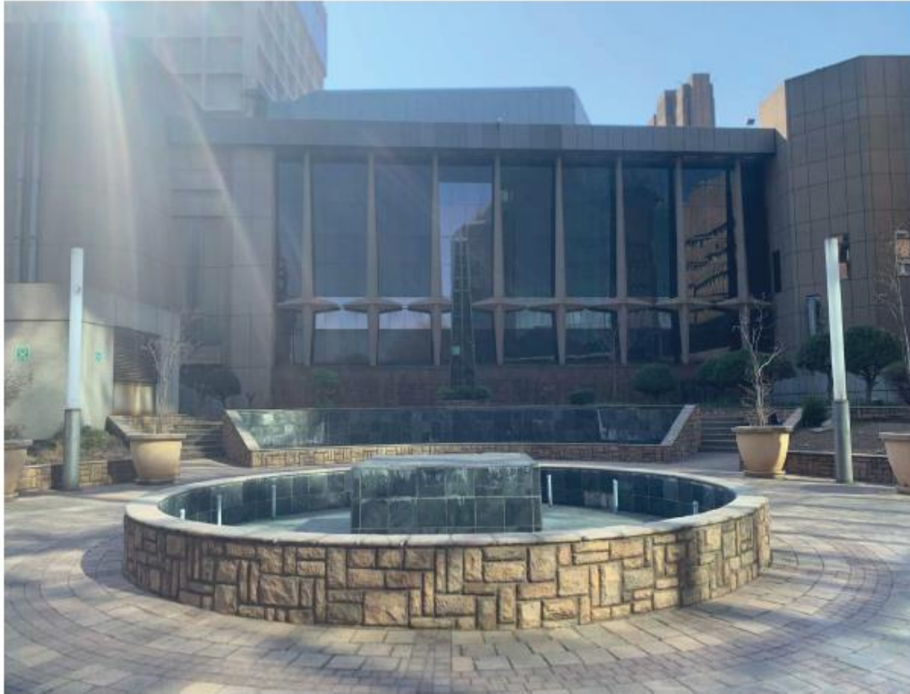
Existing fountain to be reinstated and upgraded.